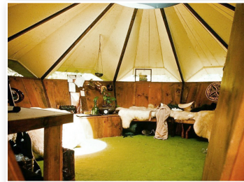
The interior of a bedroom yurt.