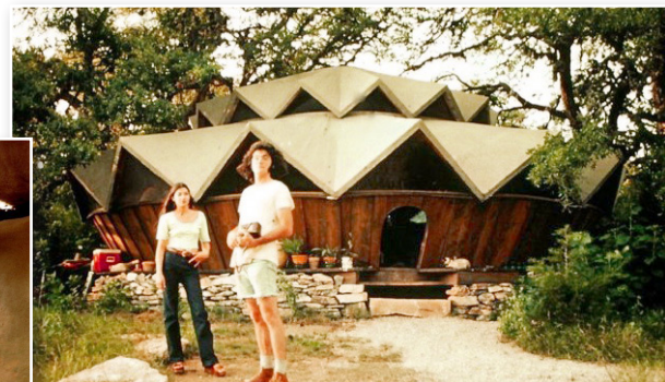
The central yurt that contained the kitchen and living areas for the community.