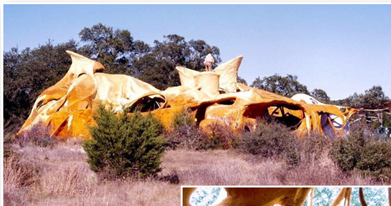
A worker stands on the roof of the Earth House (above). The view from inside of the Earth House (left).